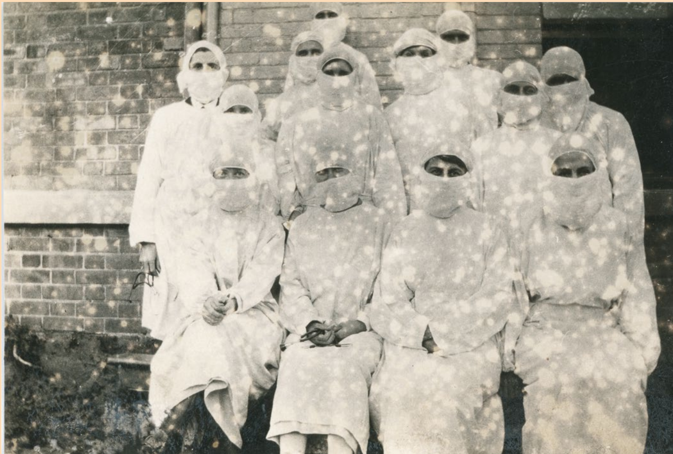
Nurses who helped people in the time of the Spanish Flu.

This is a true story about a little girl who lived through a time when a terrible virus took over Australia. This happened more than one hundred years ago.