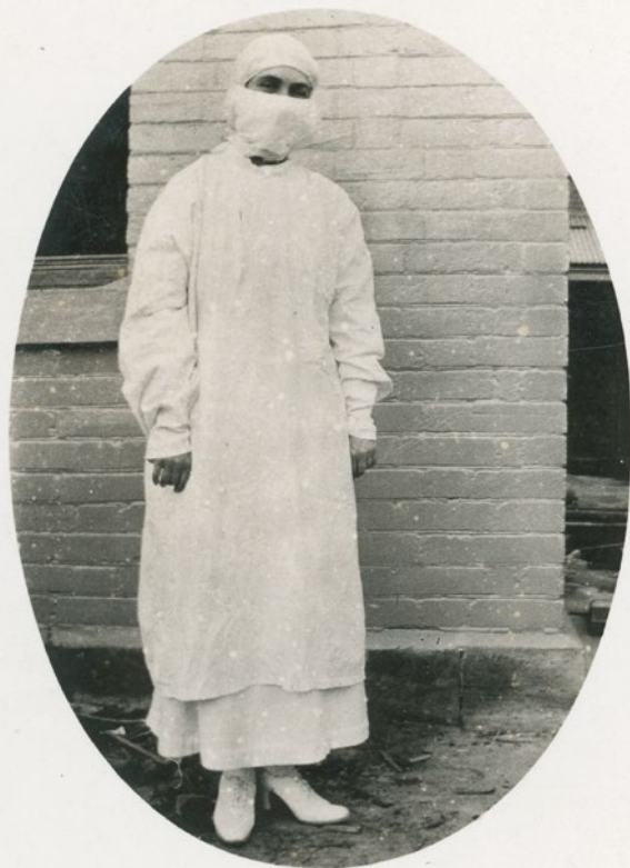
A nurse wearing a face covering to protect herself and others from the Spanish Flu.